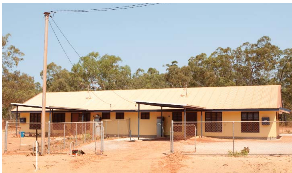
New duplex built at Umbakumba

Seventy-four rebuilds and refurbishments are complete at Angurugu, Milyakburra and Umbakumba while a further nine are underway at Angurugu and Milyakburra.