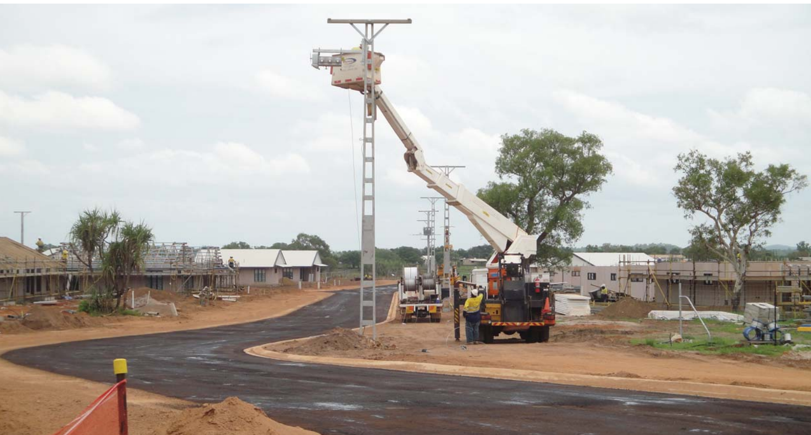
Construction in progress in the new Arrkuluk subdivision at Gunbalanya