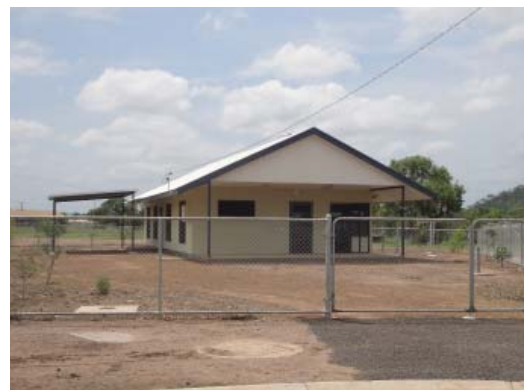
New houses built in the Banyan subdivision at Gunbalanya